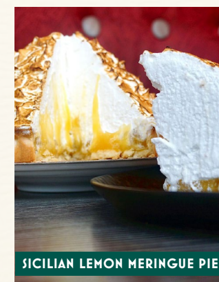
SICILIAN LEMON MERINGUE PIE