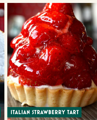
ITALIAN STRAWBERRY TART

WHY NOT TRY OUR ITALIAN BREAD & ITALIAN FRESH CREAM CAKES FOR TAKEAWAY OR DELIVERY MADE IN THE LA VITA BAKERY