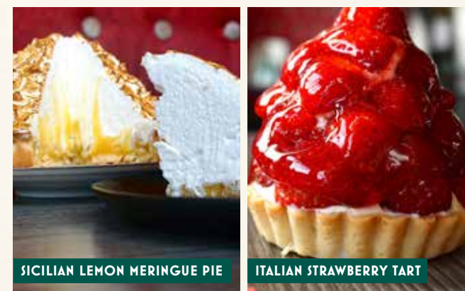
SICILIAN LEMON MERINGUE PIE