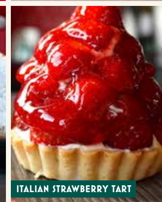
ITALIAN STRAWBERRY TART