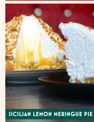
SICILIAN LEMON MERINGUE PIE