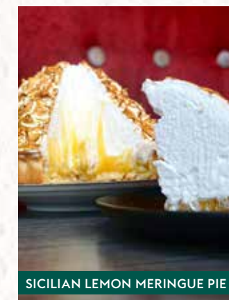
SICILIAN LEMON MERINGUE PIE