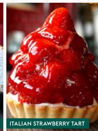
ITALIAN STRAWBERRY TART